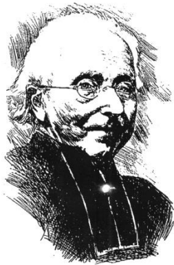
Fr Jean-Claude Colin, SM