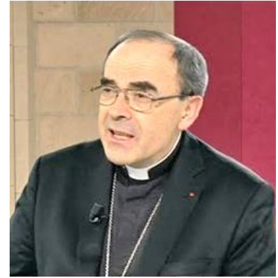
Philippe Cardinal Barbarin, Archbishop of Lyons

If you receive any grace through the intercession of Venerable Jean-Claude Colin, please communicate the information to: